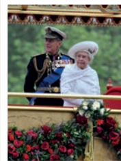
CC BY-NC 2.0.