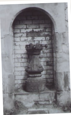
The Jubilee Pump in Rosemary Row

"better than the old muddy dirty state they used to be". It referred to the new Jubilee Pump, the new church clock and the new Girls' High School which was getting ready for opening. It is obvious that the town improved as a result of the celebrations for the Queen's