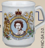
CC BY-NC-SA 2.0.

Was marked with celebrations throughout the UK and Commonwealth. The actual anniversary of The Queen's Accession on 6 February 1952 was commemorated in church services throughout that month. The Queen spent the anniversary weekend at Windsor with her family and the full jubilee celebrations began in the summer of 1977.