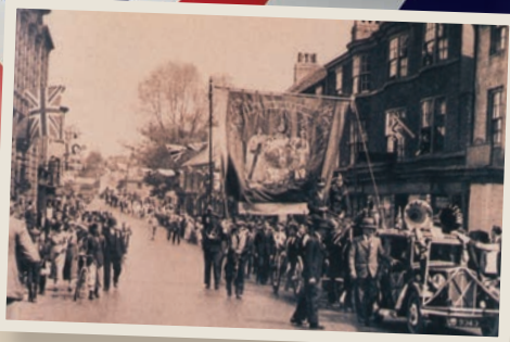
The 1935 procession for George V's Silver Jubilee

Jubilee. The 1887 church clock remains in use today, clearly being superior to the 1858 clock it replaced. The final suggestion of the extra two church bells had to wait until 1908.