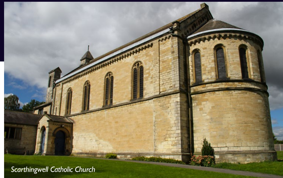
Scarthingwell Catholic Church

Right next door is Rose Trading, described by many of their customers as an 'Aladdin's Cave' the ground floor stocks a wide range of greeting cards, stationery, toys, gifts and party goods for all ages at prices well below those of the high street. The upper floor offers a wealth of craft materials with an interest in knitting yarns and patterns.