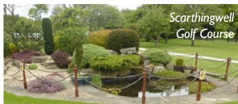
Scarthingwell Golf Course